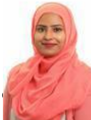
Councillor Asma Begum Deputy Mayor and Cabinet Member for Community Safety and Equalities